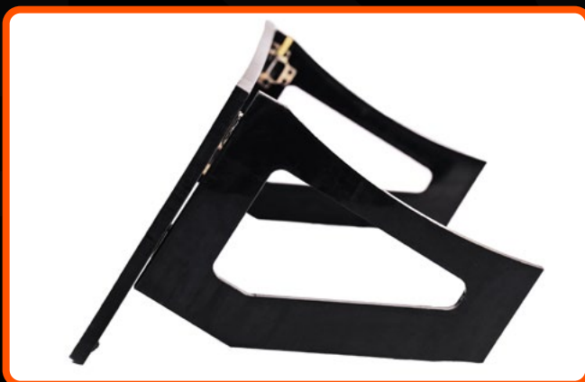
High Grade Hinged Arms