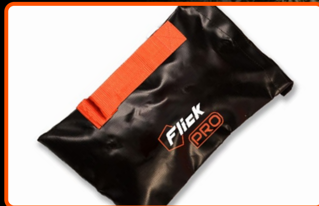
Includes 2x Weight Bags for Astro Use