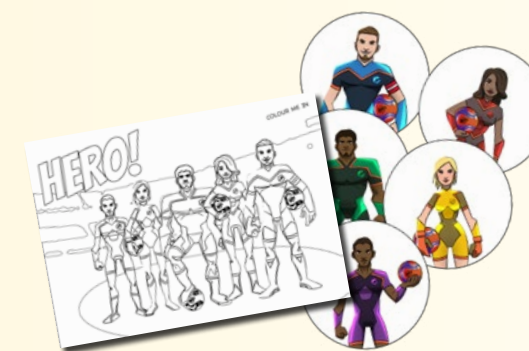
Super Added Value