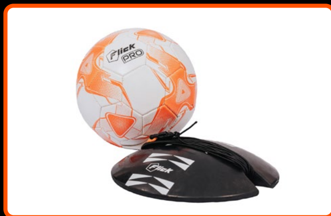
Heavy Duty Base