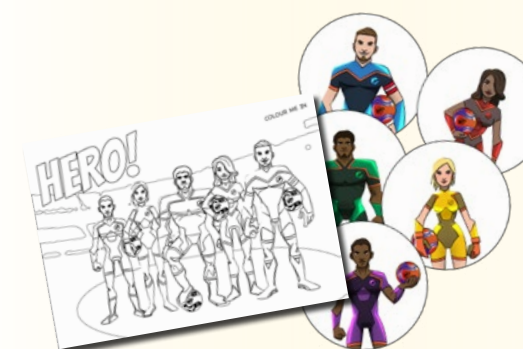
Super Added Value