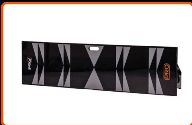
Dual Angle Design

Top specification Wall Rebounder suitable for clubs, academies and personal training environments.