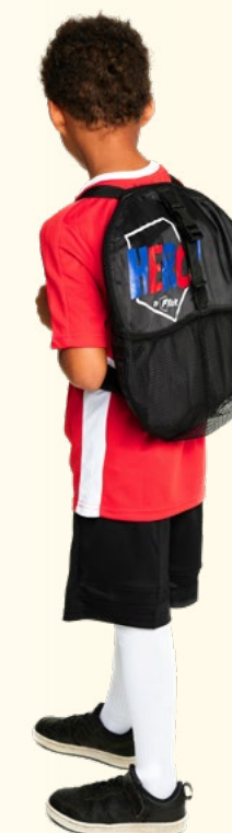
Compact Folding Design