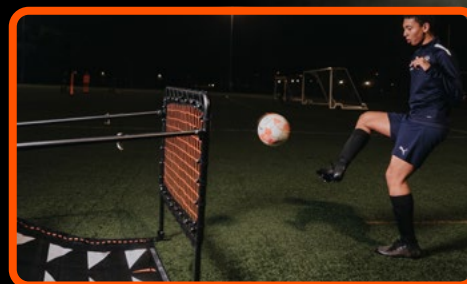
World's First Decline Rebounder