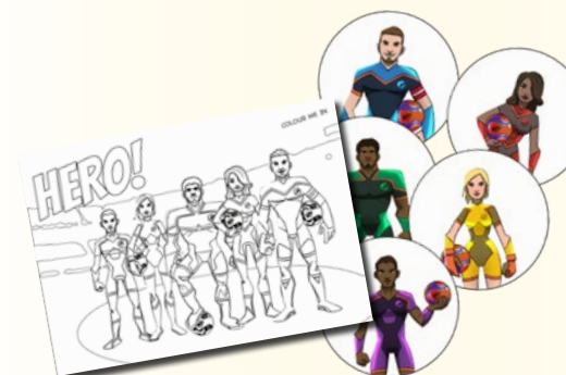
Super Added Value