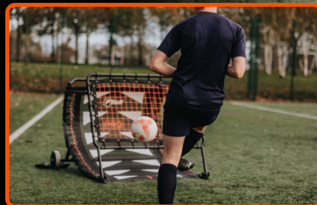
Unique Patented Design